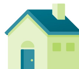
REAL ESTATE AGENT